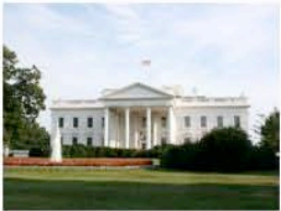
The White House

REGISTER ONLINE – BOOKING CODE XXX-XXXXX WWW.EDUCATIONALTOURS.COM