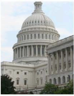
U.S. Capitol Building